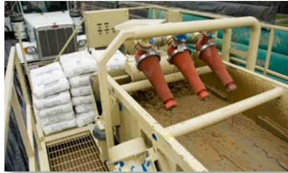
SPEEDSTAR 50K ROTARY RIG AND PORTABLE MUD CLEANER EQUIPPED WITH LINEAR MOTION SHAKER TABLES