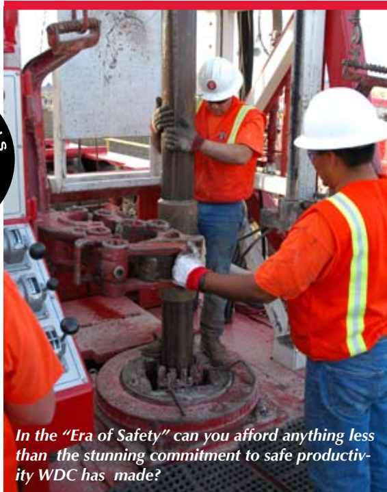
In the "Era of Safety" can you afford anything less than the stunning commitment to safe productivity WDC has made?

WDC Exploration & Wells is a company that prides itself on disciplined safety; reflecting our commitment to being a first-class company. We recognize safety as a core value of who we are and a key ingredient of our success. Our Safety Program, including our S.T.O.P. program, training, inspections, job hazards analysis, and management leadership have been a part of our journey from being a good company to a great company. Safety excellence not only adds quality to what we do in the field, it reveals the fundamental respect we have for our employees and clients.